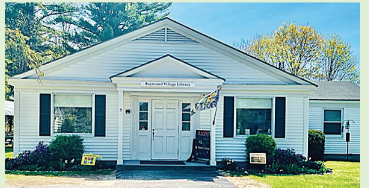
RVL Trustees and staff would like to thank the Board of Selectman and Budget-Finance Committee who voted unanimously in favor of recommending this proposal, as well as the Town Manager for his continued support.

The RVL Board of Trustees, Board of Selectman, Budget-Finance Committee, and library staff UNANIMOUSLY HOPE that you will consider casting your vote in favor of this opportunity at the town election on June 14th. The Staff and Trustees of the Raymond Village Library look forward to the possibility of becoming a Town Department, creating new and exciting opportunities. We invite you to contact us with any questions you may have and hope you will drop in to see what the library has to offer!