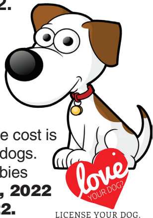
LICENSE YOUR DOG.

Dog licenses for 2022 will be available at the Town Office after October 15th or online to avoid any wait time (there is a link in the right hand column at www.raymondmaine.org ). The cost is $6 for spayed/neutered and $11 for unaltered dogs. Make sure to have on hand proof of current rabies vaccination. The deadline is January 31, 2022 and late fees begin February 1st, 2022.